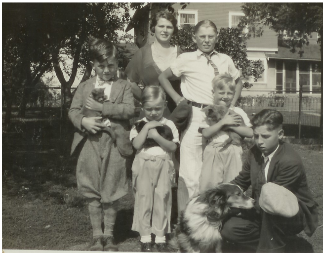
Just a few pictures of the boys from the old days.

In addition to the proximity of homes, the brothers married and had children that were of the same age or very close. This coupled with the long commitment to Nella made for a very cohesive future as will be illustrated through this section on the next generations of Nels O and Nella Ihle